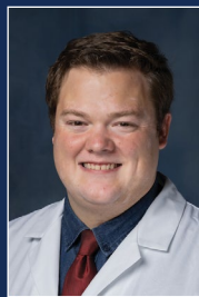
Alex Knudson, MD